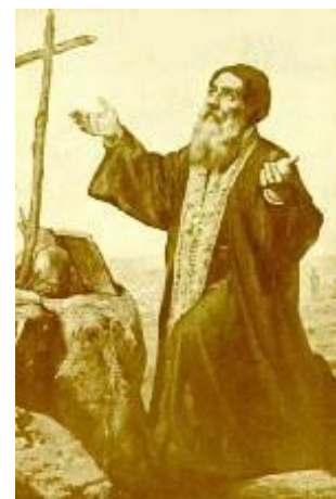
Saint Maron, pray for us!

Please share this newsletter with your mail list of family, friends, and parish members.